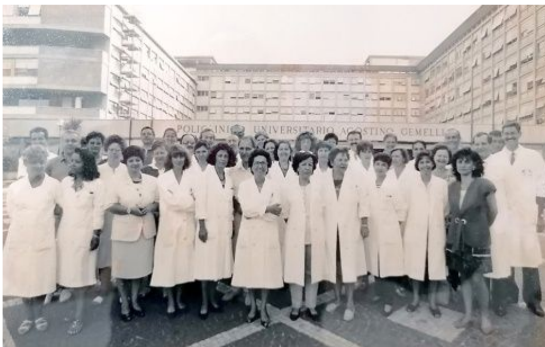
The glorious Tresalti team July 1994

He used to say that the Chief Medical Officer is a "big authorised director". This is a sentence that certainly some friends who are here will remember because these three words perfectly summarise his teaching and it is still what, after so many years, I tell medical residents.